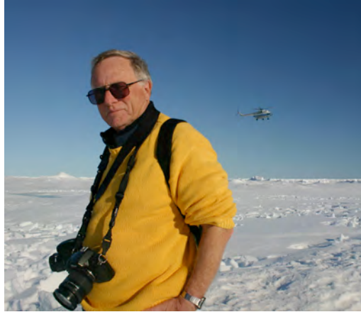
North Pole Expedition 2004